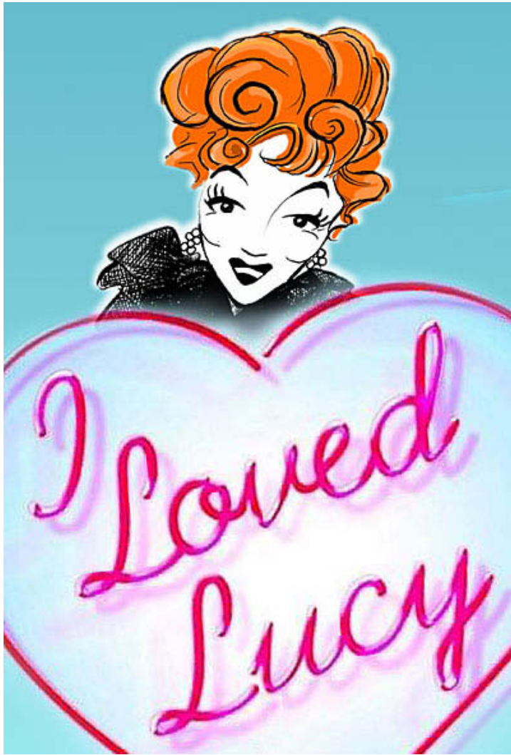
I Loved Lucy