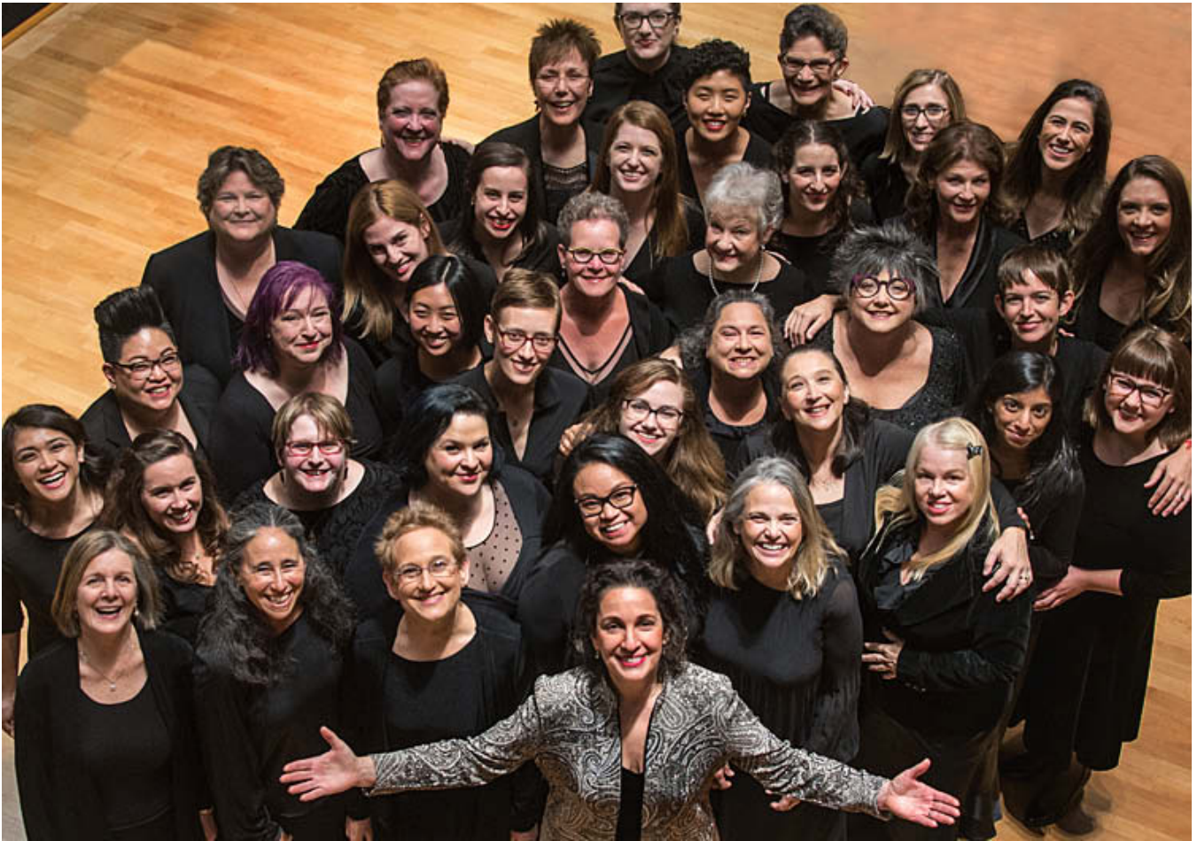
Vox Femina Los Angeles