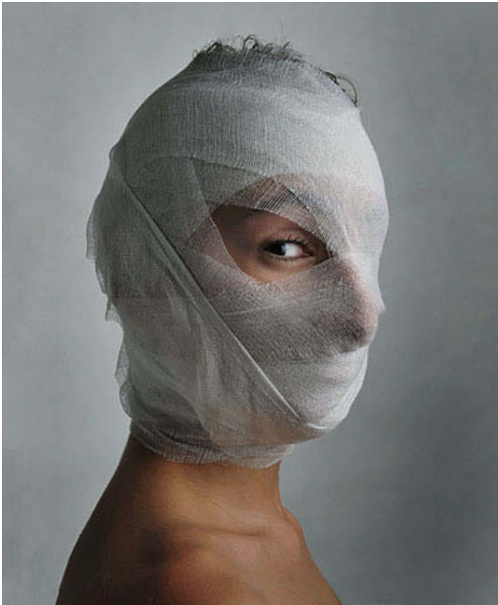
A New Brain