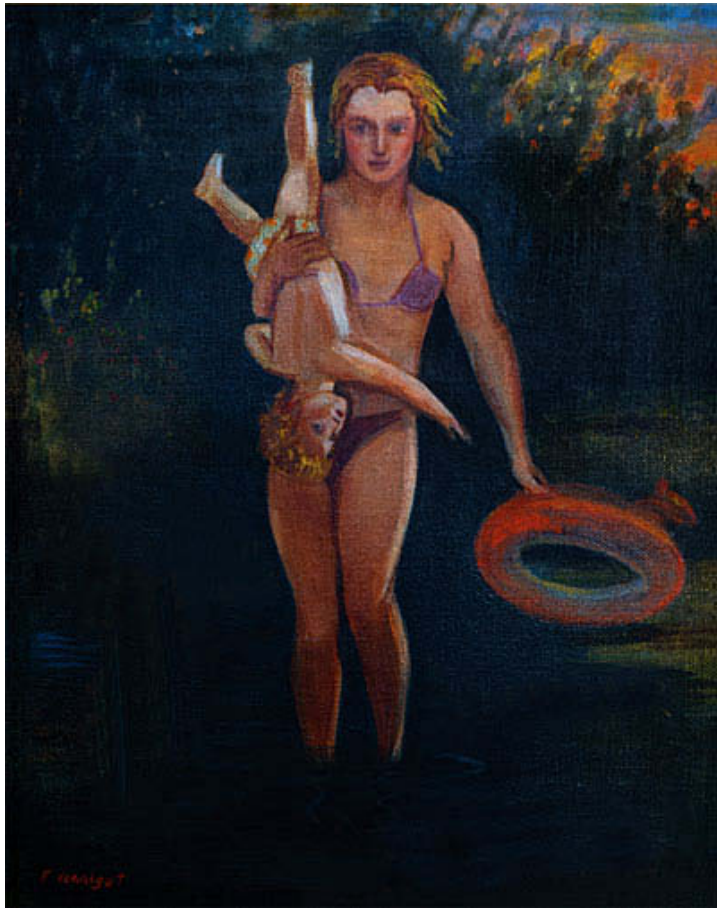
Too Much Sun poster