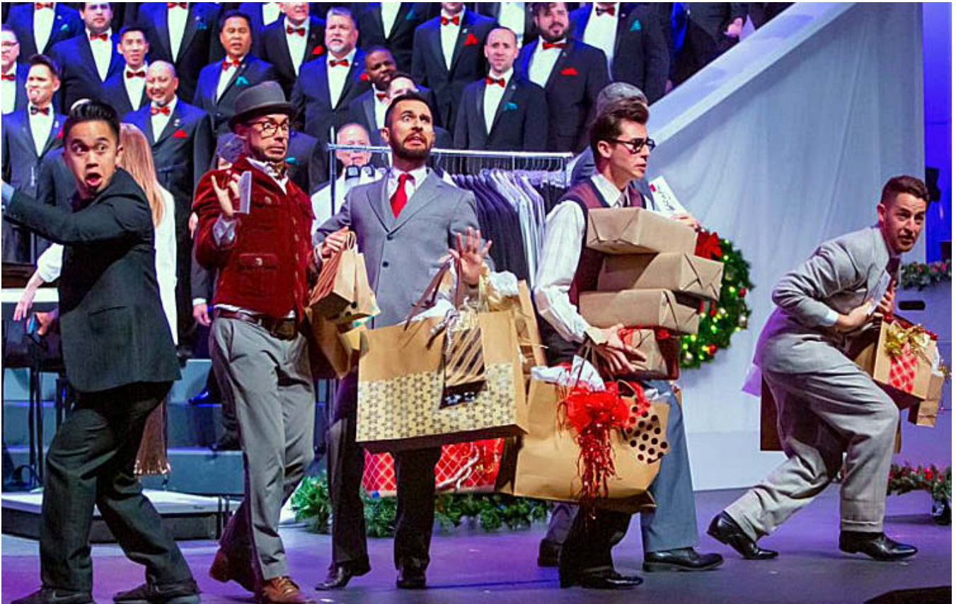
Gay Men's Chorus of Los Angeles